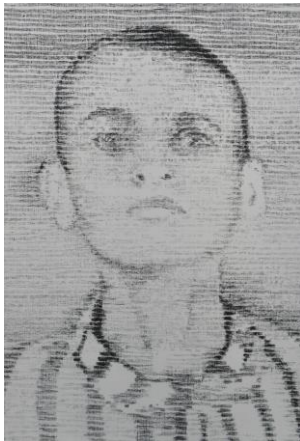
Name unknown. No. 62287

2013 150 x 110 cm Charcoal on canvas